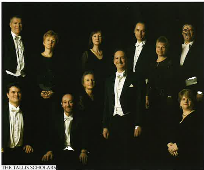
THE TALLIS SCHOLARS